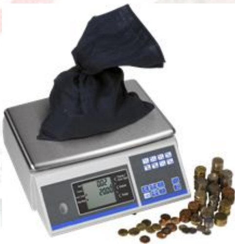
Large Digital Coin Scales