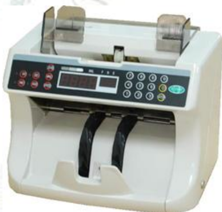
Standard Note Counter

Counts at approx 1,000 notes/min Hopper Capacity 200 notes Stacker Capacity 200 notes Net Weight: 2.8 Kilos