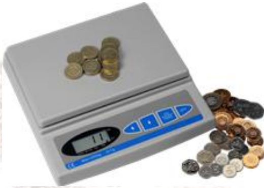
Mini Digital Coin Scales