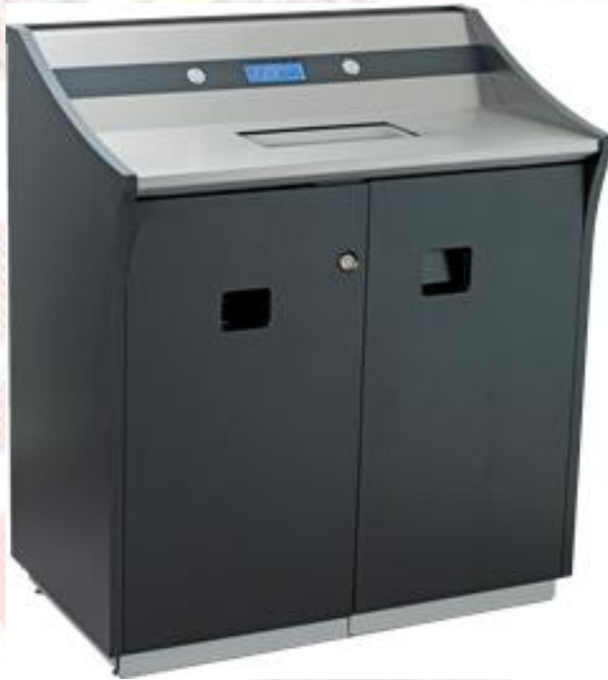
Panda + Range

Cash deposit systems save organisations time and money by simplifying the cash-handling process. By eliminating the human element, companies save valuable time and resources and increase accuracy and security in one simple integrated solution.