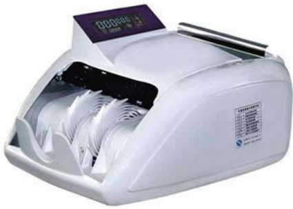
Basic Note Counter