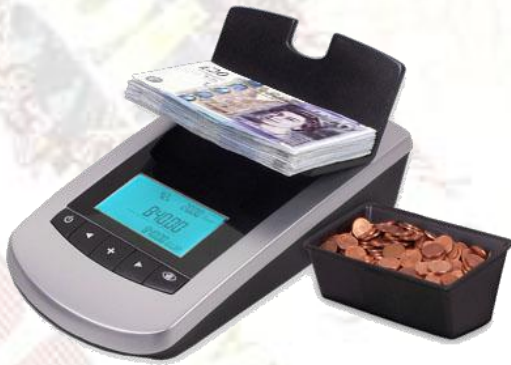
Mini Cash Scales

Counting pre-sorted notes and coins together is quick and easy when you count by weight. To be used in conjunction with forgery detectors, Cash Scales can often be the quickest and most effective solution