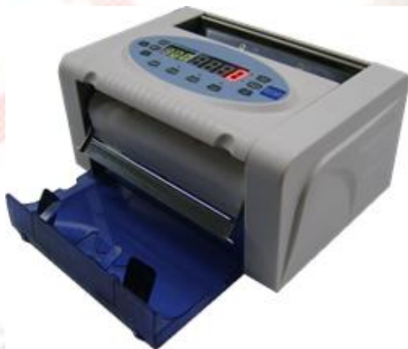
Portable Note Counter

Counting Speed 1,000 notes per min Hopper Capacity 200 notes Stacker Capacity 200 notes Dimensions 265(L) x 235(W) x 190(H) Net Weight: 2.8Kilos