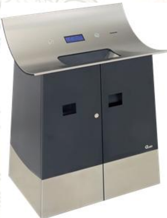
Penguin + Range

Options include: Coin cartridge, multi bagging, header and footer programme, card reader, key pad, touch screen, bank note acceptor, SMS text messaging of status on the machine, optional colour.